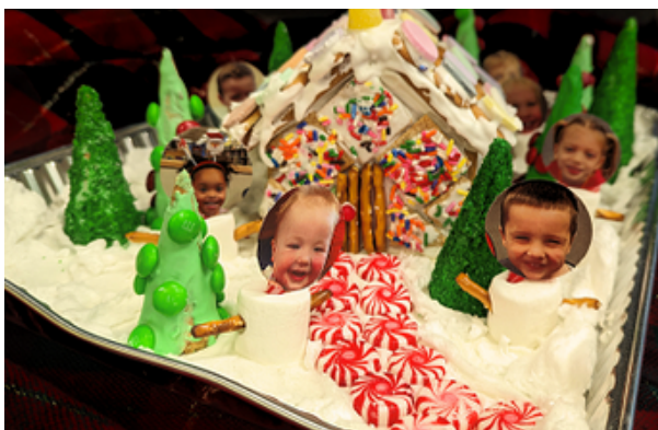
Storytime Sugar House / Gingerbread House Tour