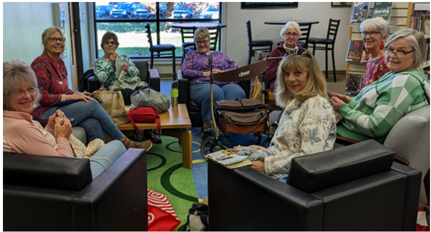
Weekly Drop-in Knitters; Everybody is Welcome!

Trustees meet bimonthly on the 3rd Tuesday starting January. Meetings are at 5:00pm in the Community Room, and are open to the public. Schedules may change and should be confirmed on our website.